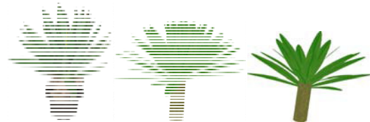
Figure 4: A real yucca photo together with models generated with 100 (centre) and 10 (right) iterations of the system above.

axiom → A(175,25,250) A(s,t,l) → F(s,t) B(7,6,1,60,s,t) B(h,v,l,d,s,t) → BN(h,v,v,l,d,s,t) BN(h,v,i,l,d,s,t) → LR(h,l,d*v/i) / (13) F(s/10,t) BN(h-0.4,v-1,i,l,d,s/2,t) LR(n,l,d) → LRN(n,n,l,d) LRN(i,n,l,d): i = 0 → eps LRN(i,n,l,d): i > 0 → [(+d)L(l)] / (360/n) LRN(i-1,n,l,d)