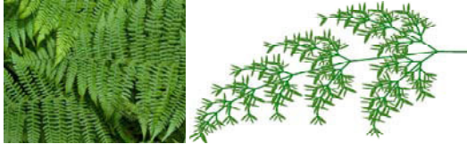
Figure 5: A real fern photo together with a generated model (20 iterations).

axiom → S S → F(2,1) [ +(40)/(90) L(11,1) ] [ +(-40)/(90) L(11,1) ] + (9) F(2,1) [ /(90) L(11,4) ] F(s,t) → F(s*1.2,t) L(1,i): i < 4 → L(1*1.2, i+1) L(1,i): i = 4 → [ / (270) S ]