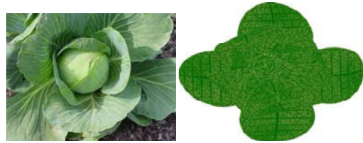
Figure 6: A real cabbage photo together with a generated model (10 iterations).

axiom → B(4,100,75) B(h,l,d) → LR(h,l,d) / (13) B(h-0.3,l,d/2) LR(n,l,d) → LRN(n,n,l,d) LRN(i,n,l,d): i = 0 → eps LRN(i,n,l,d): i > 0 → [ +(d)L(l) ] / (360/n) LRN(i-1,n,l,d)