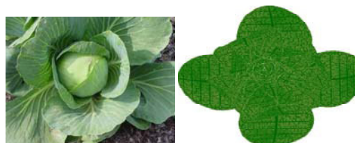
Figure 6: A real cabbage photo together with a generated model (10 iterations).

axiom → B(4,100,75) B(h,l,d) → LR(h,l,d) / (13) B(h-0.3,l,d/2) LR(n,l,d) → LRN(n,n,l,d) LRN(i,n,l,d): i = 0 → eps LRN(i,n,l,d): i > 0 → [ +(d)L(l) ] / (360/n) LRN(i-1,n,l,d)