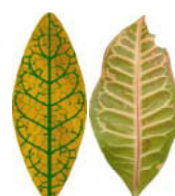
Figure 1: Generated leaf vs. real leaf image.

The following figure compares the actual photo of a croton leaf with an artificially generated equivalent. As can be seen, considerable dissimilarities remain apparent.