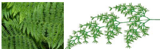
Figure 5: A real fern photo together with a generated model (20 iterations).

axiom → S S → F(2,1) [ +(40)/(90) L(11,1) ] [ +(-40)/(90) L(11,1) ] + (9) F(2,1) [ /(90) L(11,4) ] F(s,t) → F(s*1.2,t) L(1,i): i < 4 → L(1*1.2, i+1) L(1,i): i = 4 → [ / (270) S ]