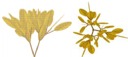
Figure 3: Plant generated from the system above (3 iterations).

axiom → A(100,5,200) A(s,t,l) → [&(22.5)F(s,t,l)L(l)A(s,t/2 + 2,l)] / (5*22.5) [&(22.5)F(s,t,l)L(l)A(s,t/2 + 2,l)] / (7*22.5) [&(22.5)F(s,t,l)L(l)A(s,t/2 + 2,l)] F(s,t,l) → S(t,s,l) / (5*22.5) F(s,t,l) S(s,t,l) → F(t,s,l)