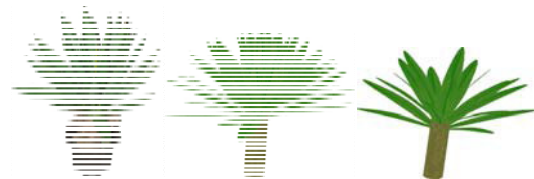
Figure 4: A real yucca photo together with models generated with 100 (centre) and 10 (right) iterations of the system above.

axiom → A(175,25,250) A(s,t,l) → F(s,t) B(7,6,1,60,s,t) B(h,v,l,d,s,t) → BN(h,v,v,l,d,s,t) BN(h,v,i,l,d,s,t) → LR(h,l,d*v/i)/(13) F(s/10,t) BN(h-0.4,v-1,i,l,d,s/2,t) LR(n,l,d) → LRN(n,n,l,d) LRN(i,n,l,d): i = 0 → eps LRN(i,n,l,d): i > 0 → [(+d)L(l)]/(360/n) LRN(i-1,n,l,d)