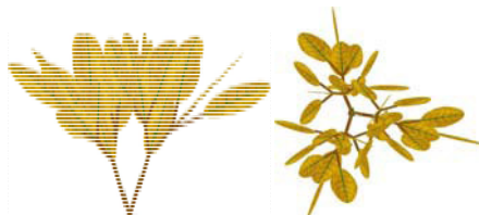
Figure 3: Plant generated from the system above (3 iterations).

axiom → A(100,5,200) A(s,t,l) → [&(22.5)F(s,t,l)L(l)A(s,t/2 + 2,l)]/(5*22.5) [&(22.5)F(s,t,l)L(l)A(s,t/2 + 2,l)]/(7*22.5) [&(22.5)F(s,t,l)L(l)A(s,t/2 + 2,l)] F(s,t,l) → S(t,s,l)/(5*22.5) F(s,t,l) S(s,t,l) → F(t,s,l)